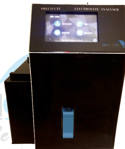
PreciLYTE-i+ (Electrolyte Analyzer)