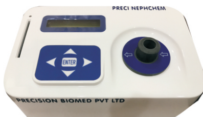
Preci Nephchem (A Specific Protein Analyzer/ Nephelo-Chemistry Analyzer)